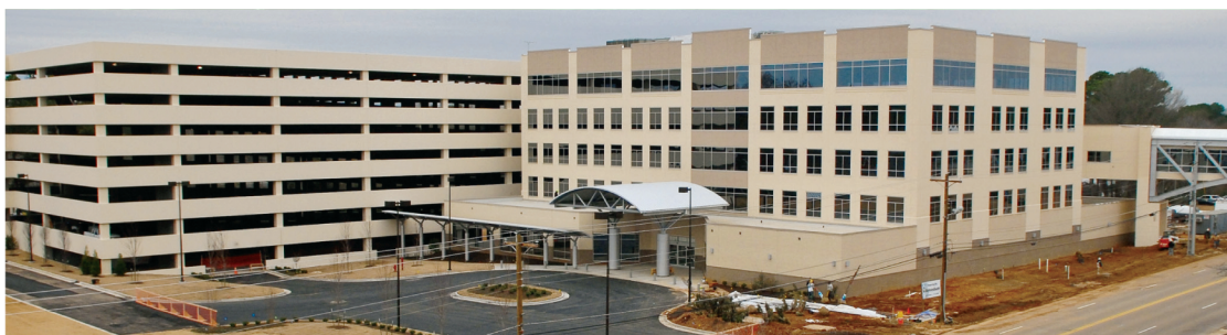
The eight-floor, 676-space garage was phase one of a five-phase hospital expansion.

The central monitoring site would be located 2,500 feet from the termination room in the new parking complex. This distance was beyond the capability of coaxial cable and the decision to use fiber optic cabling became essential. The design specified