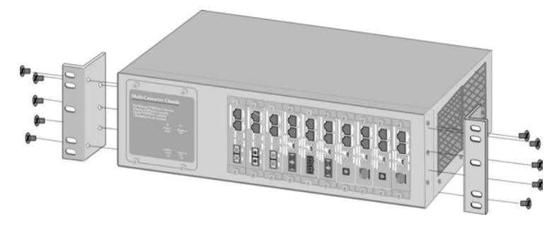
Attaching Mounting Brackets

1. Position one bracket to align with the holes on one side of the switch and secure it with the smaller bracket screws. Then attach the remaining bracket to the other side of the switch.