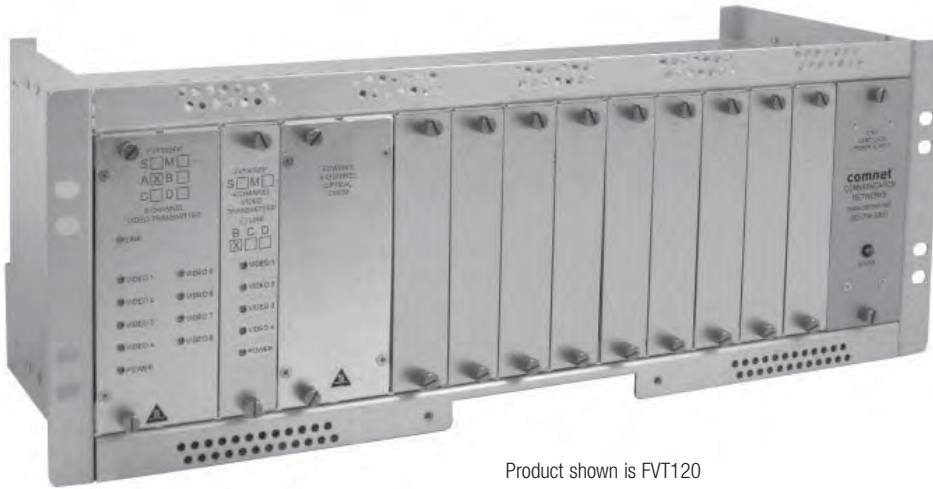
Product shown is FVT120